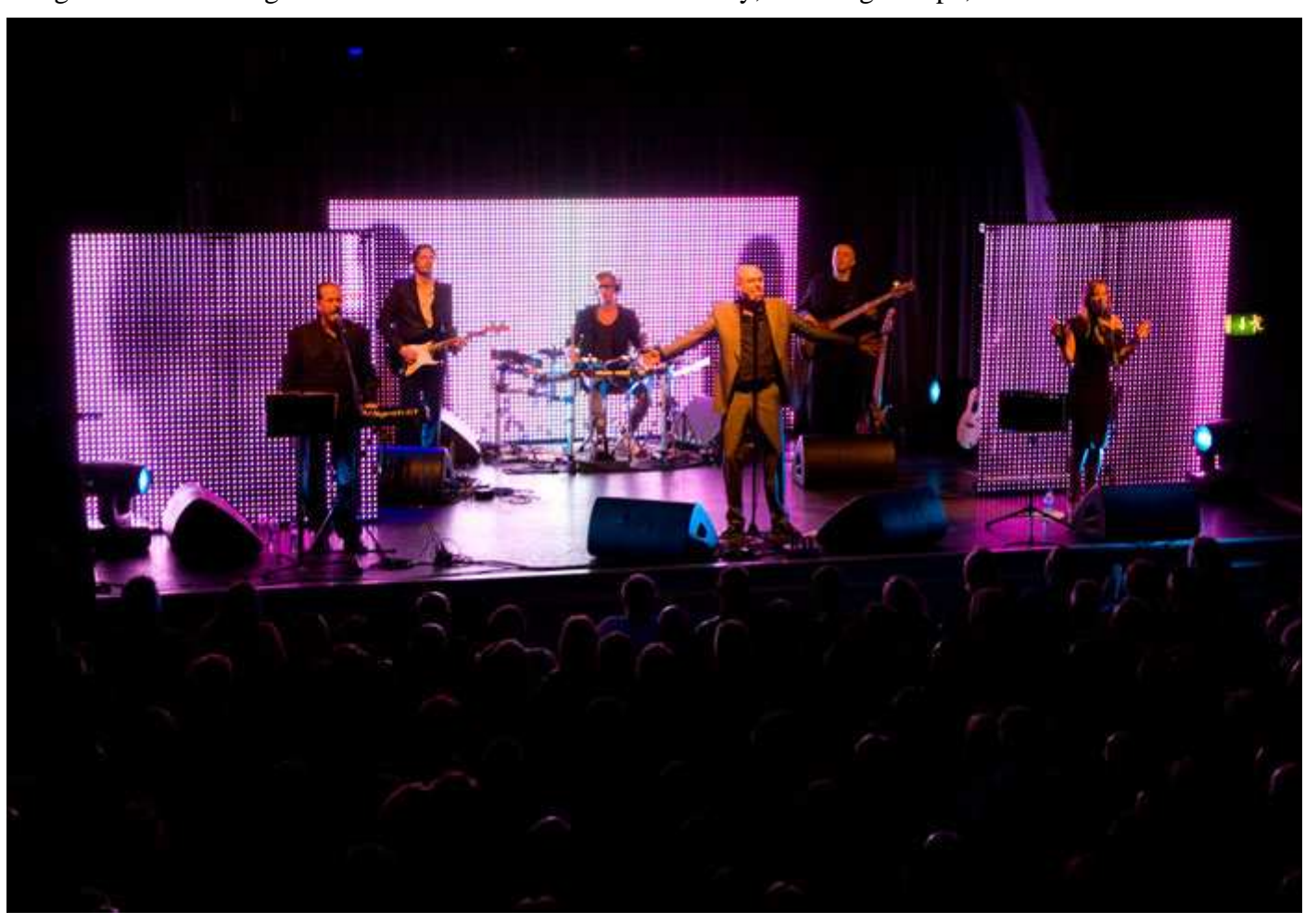
Set list - in vague-ish order - the memory is not what it was!

(We Don't Need This) Fascist Groove Thang Penthouse and Pavement Play to Win Geisha Boys and Temple Girls (Acoustic) Soul Warfare Wichita Lineman Perfect Day Ball of Confusion These Boots Were Made For Walking I'm Your Money Geisha Boys and Temple Girls Let's All Make A Bomb The Height of the Fighting Song with No Name We're Going To Live For A Very Long Time Let Me Go Temptation Are Everything Being Boiled