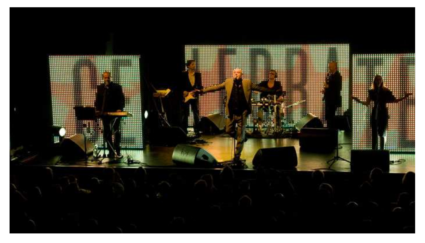
"No-one was supposed to turn up for this one!"